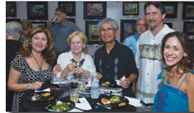
BeachFire will again cater the Gala Dinner Tickets are only $35.

All proceeds from this event will be dedicated to the San Clemente Art Association's "Art Reach Program", benefiting San Clemente Public School Art Program.